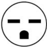
Tandem 230/208V. 15 Amp.

If your plug is not compatible with the outlets above, you will need to bring your own adaptor or change the plug before arrival. All adapters must meet professional standards and safety protocols. (no hand-made or ungrounded adapters allowed)