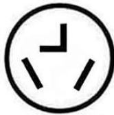
10-30 250V OLD DRYER