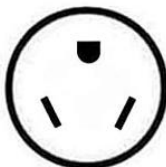
TT-30 125V RV CAMPER