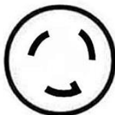
L6-30 250V MULTI-USE