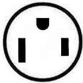
6-50P 250V WELDER