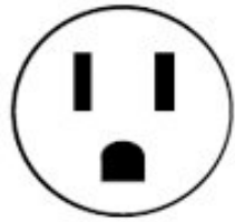
Parallel 115V. 15 Amp.