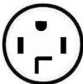
14-30 250V NEW DRYER